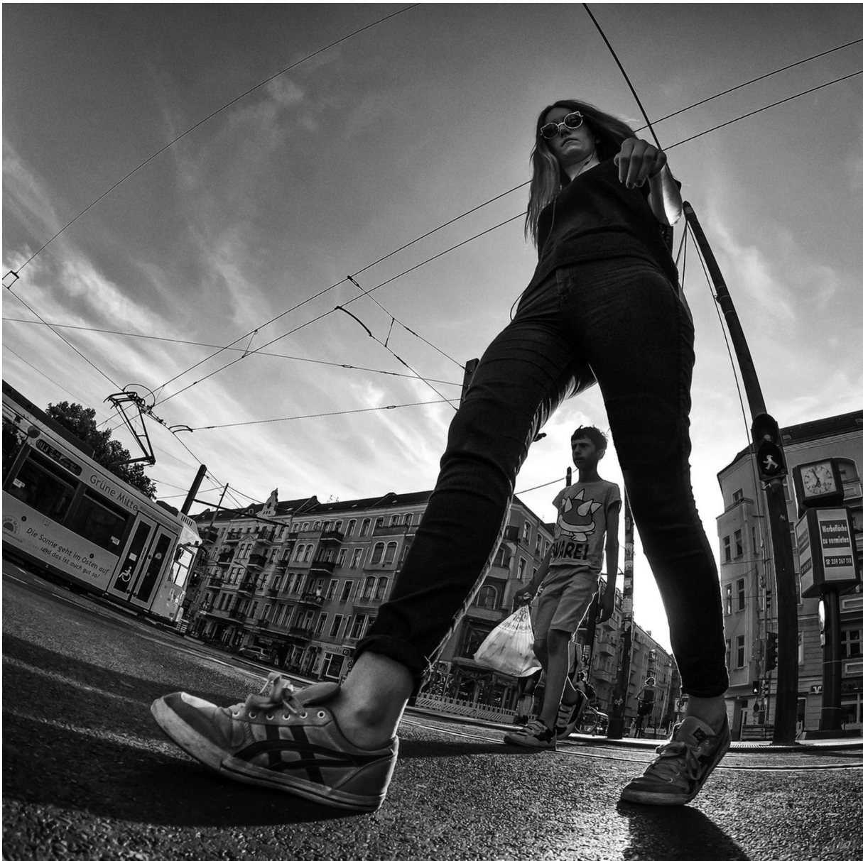
Repetition (2015) by Willem Jonkers