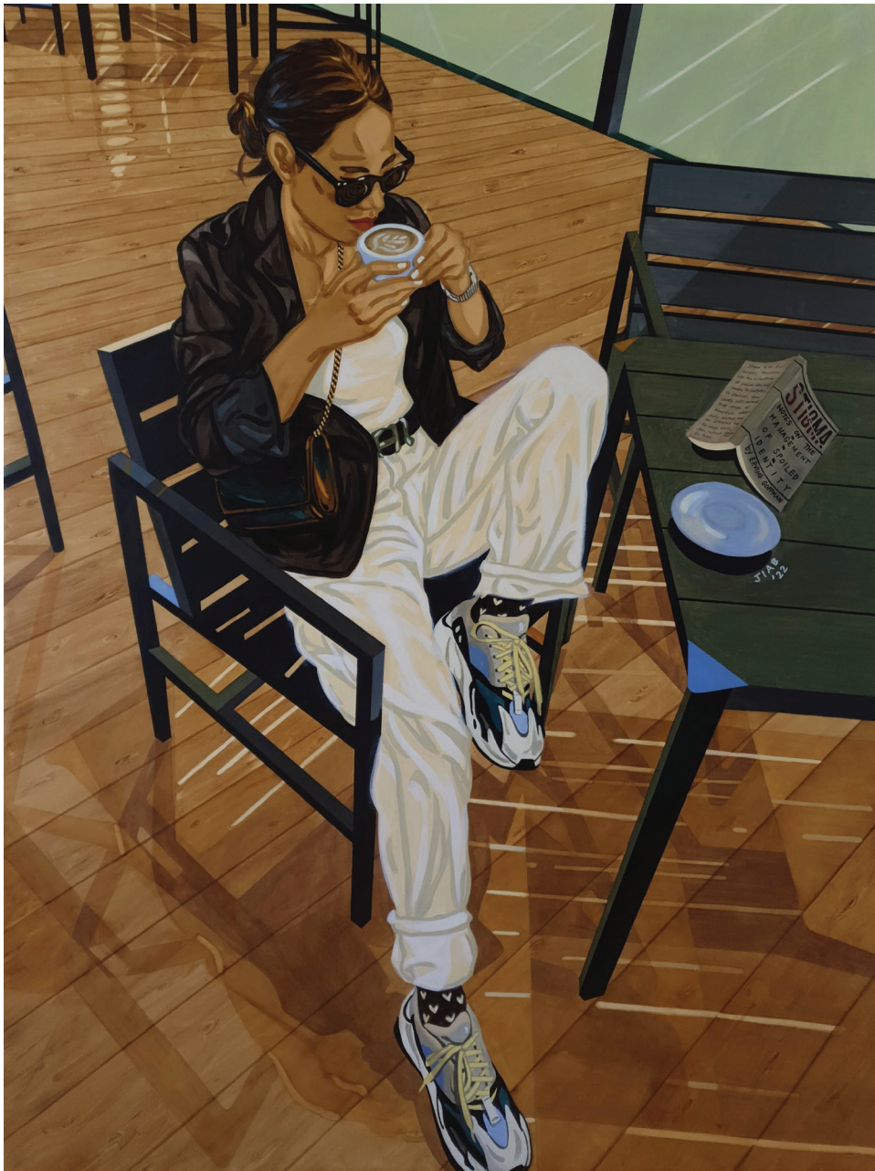
Young Sister (2022) by Jiab Prachakul acrylic on linen (160 × 120 cm)

2. Analyse the following elements of this painting: