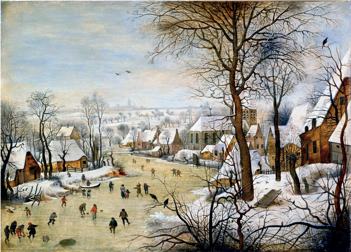
Winter Landscape with Skaters and Bird Trap (1565) by Pieter Bruegel the Elder oil paint on panel (37 × 56 cm)

5. Analyse the following elements of this painting: