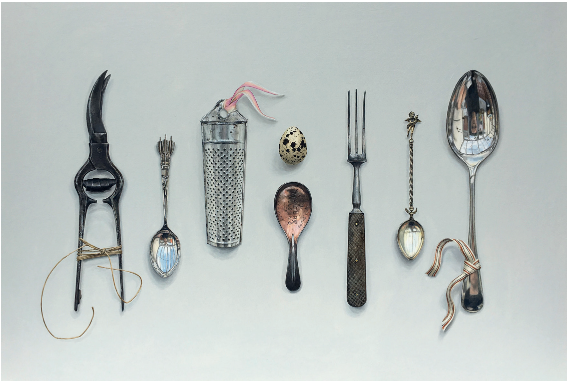
Kitchenalia (2019) by Rachel Ross acrylic paint on panel (54 × 80 cm)

3. Analyse the following elements of this painting: