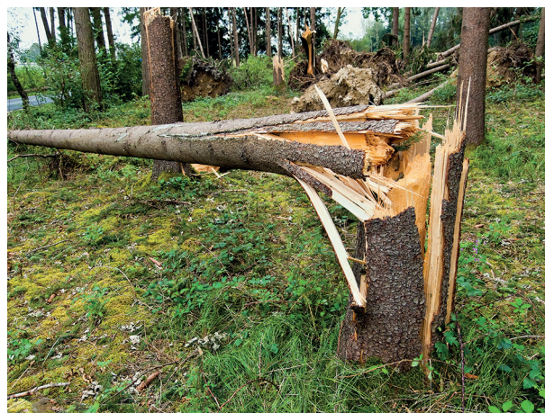
Source 2 A photograph of damage caused by Storm Arwen