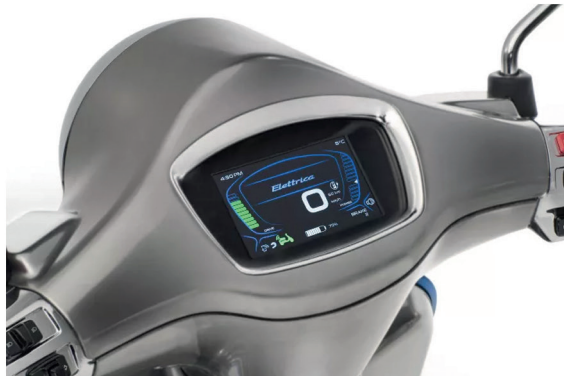
Electric Scooter (2021) by Vespa

Materials: steel frame, rubber, leather and chrome (weight: 130 kg, dimensions: 187 × 74 × 115 cm)