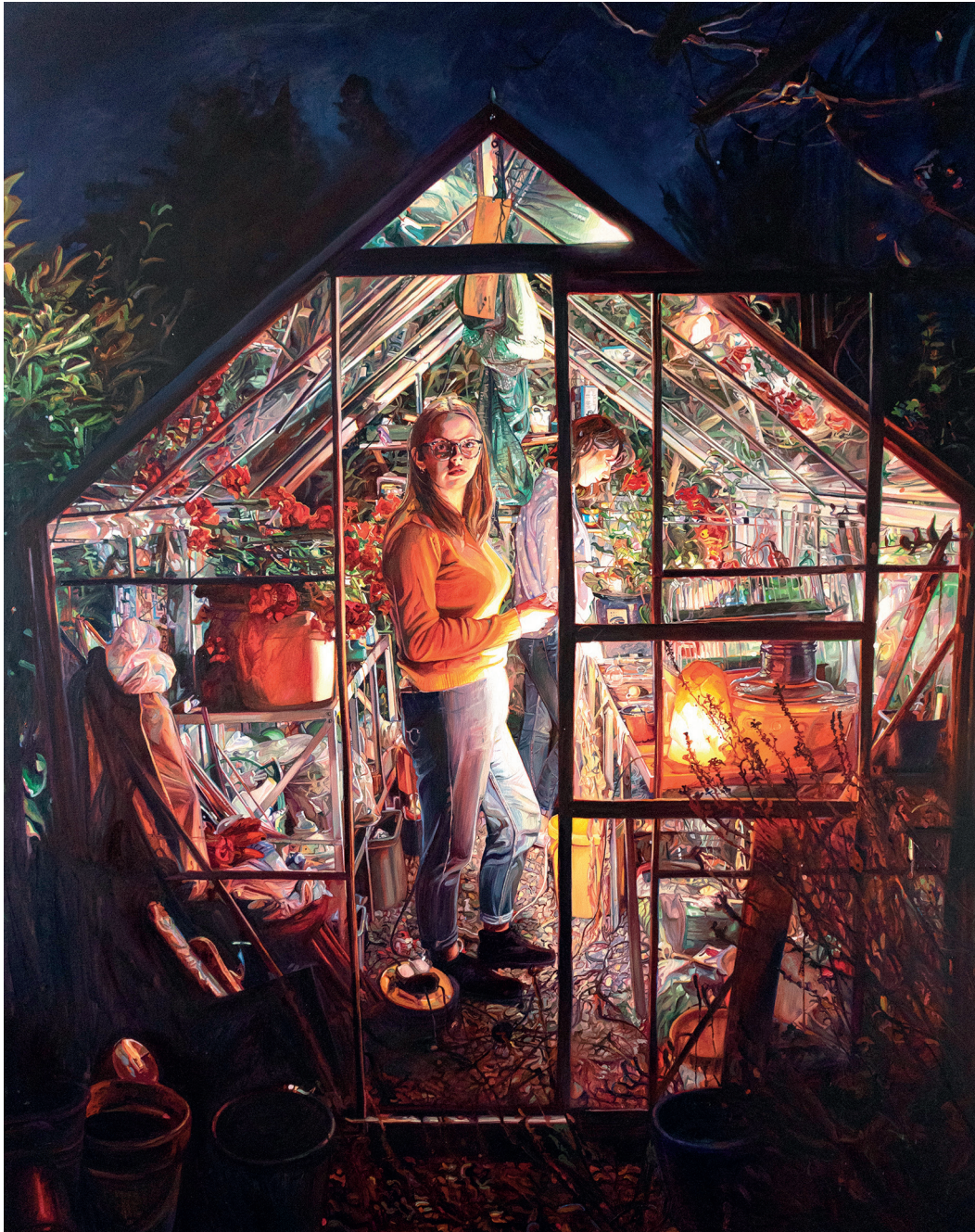
Geraniums (2018) by Ruth Murray oil paint on canvas (190 × 150 cm)

5. Comment on this painting, referring to: