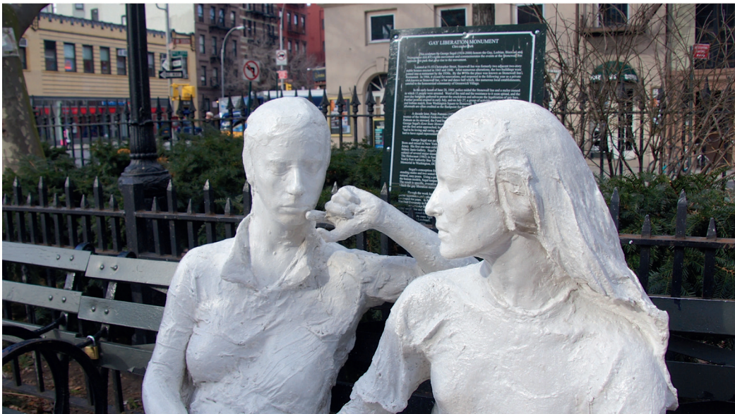
Gay Liberation (1980) by George Segal painted bronze (life-size)

6. Comment on this sculpture, referring to: