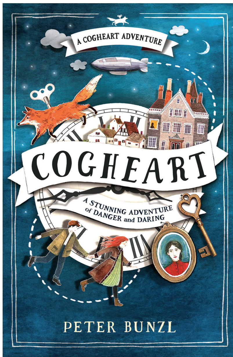
Cogheart book cover (2016) by Becca Stadtlander

8. Comment on this book cover design, referring to: