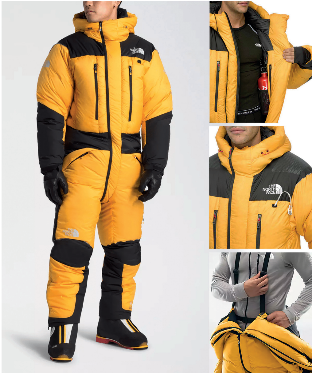
Himalayan Suit (2011) by The North Face

Materials: 800 fill goose down 1 , 100% nylon ripstop fabric 2