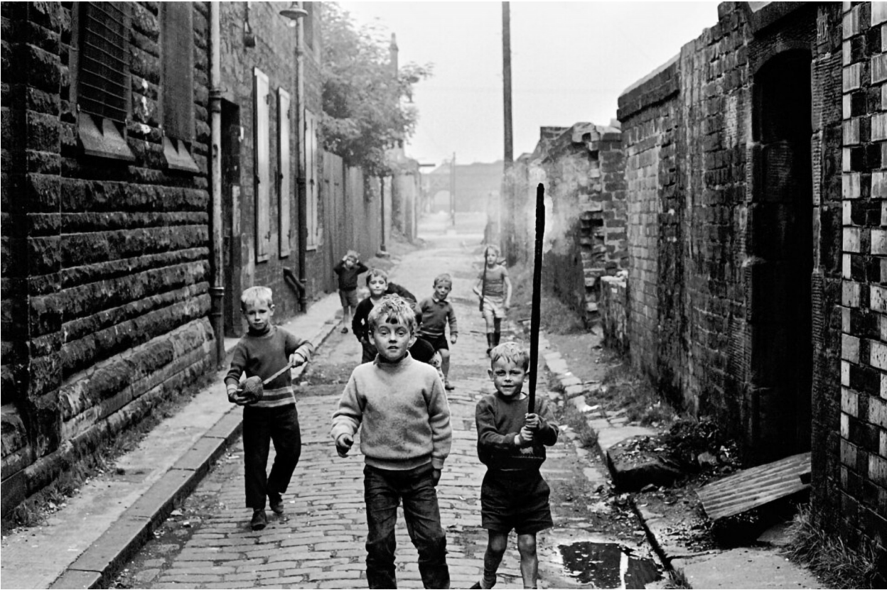
An Eye on the Street, Glasgow (boys in back lane with burning stick) (1968) by David Peat black and white photograph (25 × 38 cm)

3. Comment on this photograph, referring to: