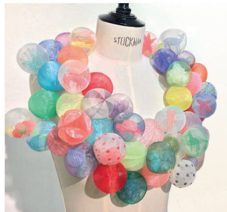
Capsule Necklace (2016) by Mariko Kusumoto Materials: heat set polyester fibre (40 × 30 cm)

11. Comment on this necklace design, referring to: