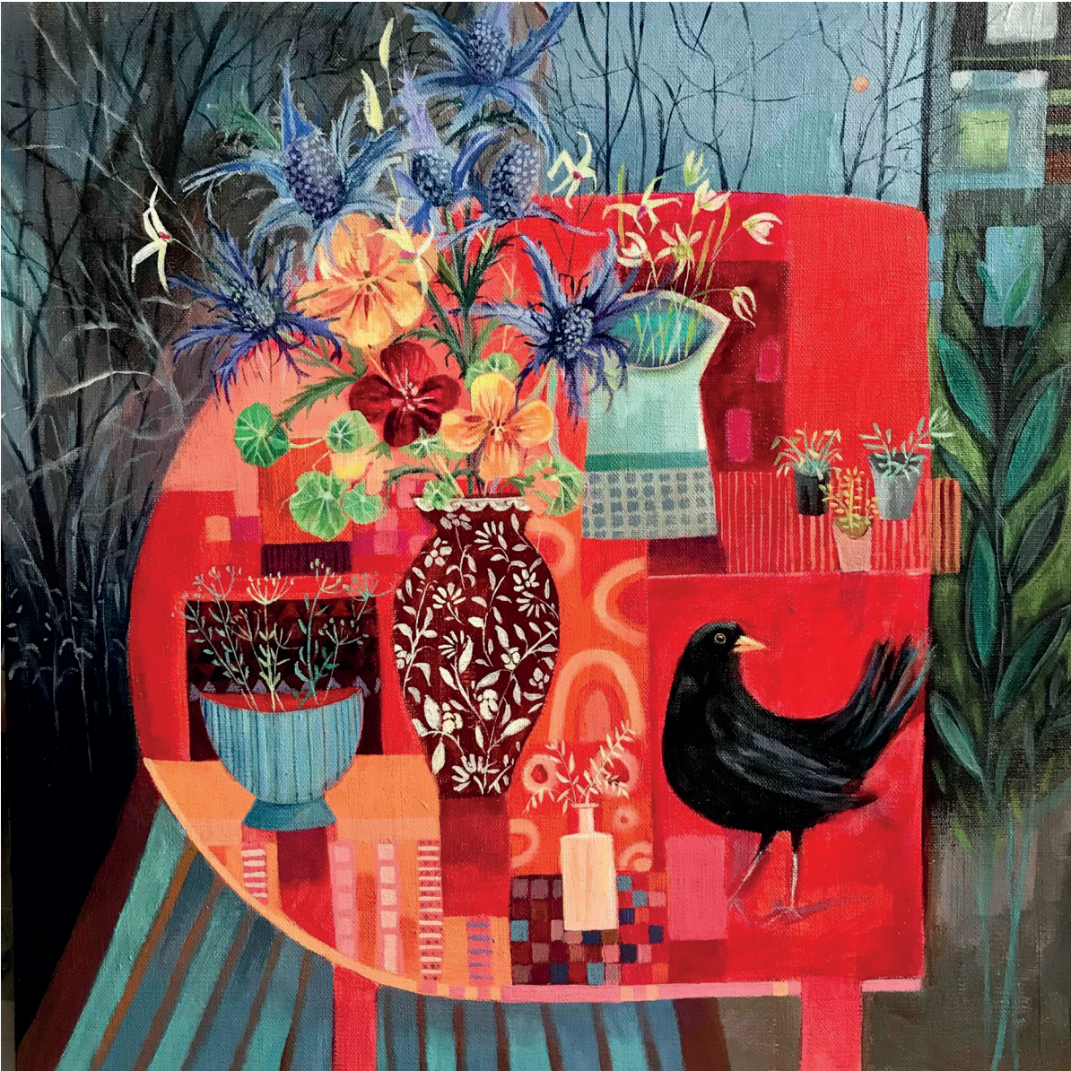
Red Table (2021) by Morag Stevenson acrylic on board (40 × 40 cm)

4. Comment on this painting, referring to: